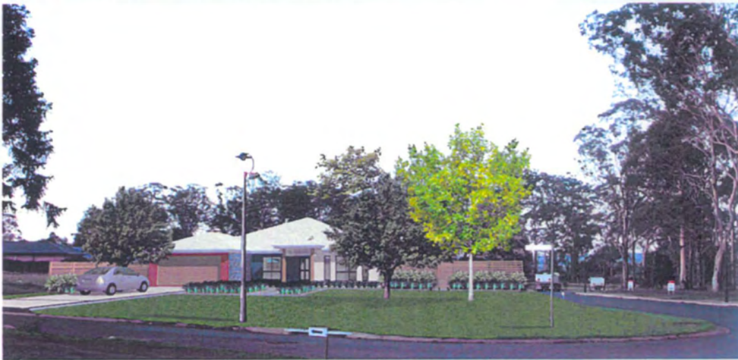
exterior perspective view 2