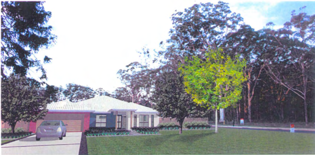
exterior perspective view 1