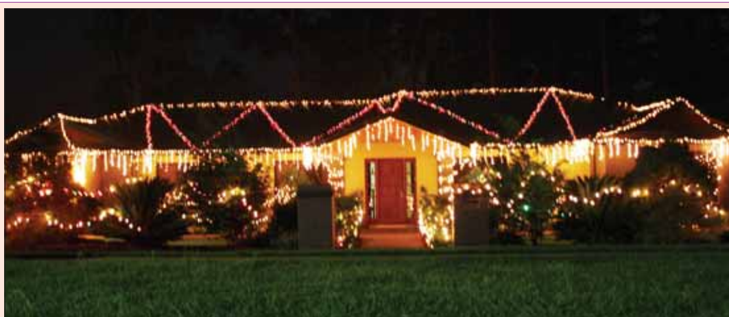
Highfields Christmas lights - Clarke Road.