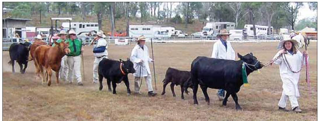
Cattle in the grand parade. The supreme champion beast of show was exhibited by J. E. Weise.