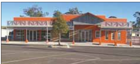
New community centre - ideal for auctions

Two house blocks in Heritage Park Estate, Crow's Nest, were passed in at auction at Ray White Rural's auction in the RSL rooms in Crow's Nest community centre on March 26.