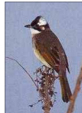
BULBUL Warbling song

The warbling song was quite pretty and each day a pair came and sat in the tree.