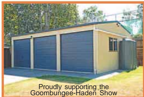
Proudly supporting the Goombungee-Haden Show

Specialists in Carports, Garages, Farmsheds & Commercial Sheds.