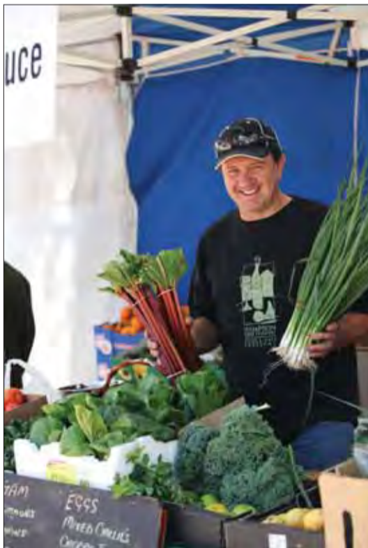
Fresh local produce will be on sale at the Hampton Food and Arts Festival on Sunday, May 16.