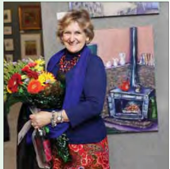
Prizewinning artist Pixie Roediger at last year's Hampton High Country Food and Arts Festival.

Highfields to Hampton courtesy of Bus Queensland Toowoomba. Check bus times and more at the Festival website, www.hamptonfestival.com .