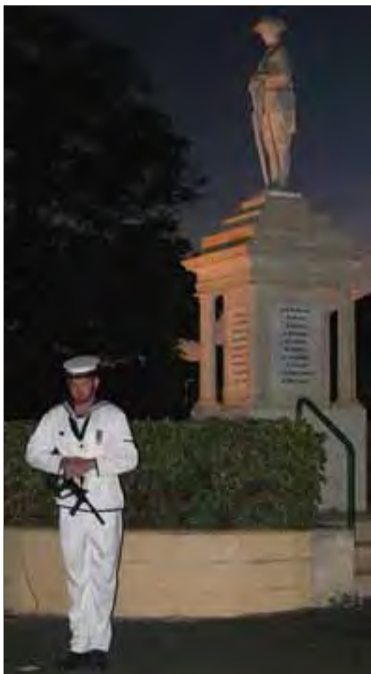
Goombungee Anzac Day dawn service. Contributed photograph study.