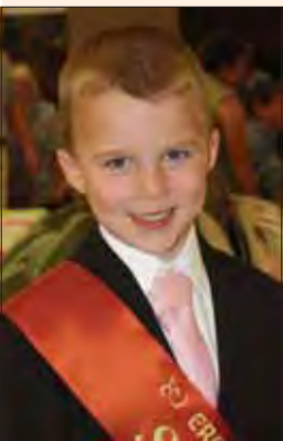
Elliott Root Show Prince