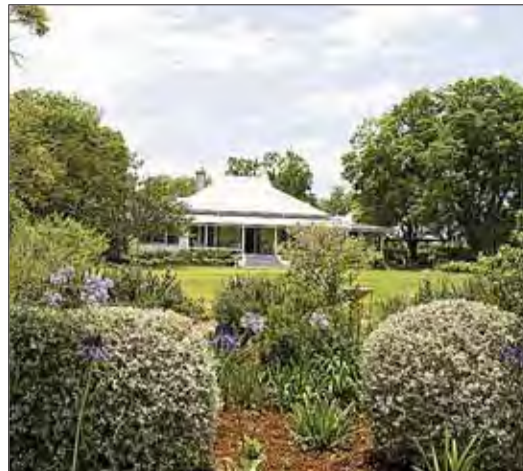
Argyle, Kingsthorpe, garden on six acres.

Australia's Open Garden Scheme is a not-for-profit