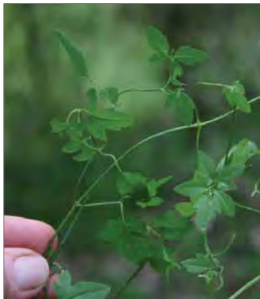
Fawcett's Clematis - a rare treasure