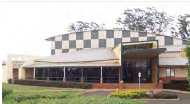
Highfields Cultural Centre - Scene of special event.

"I am thrilled to be celebrating the spirit of Christmas with seniors and look forward to en-