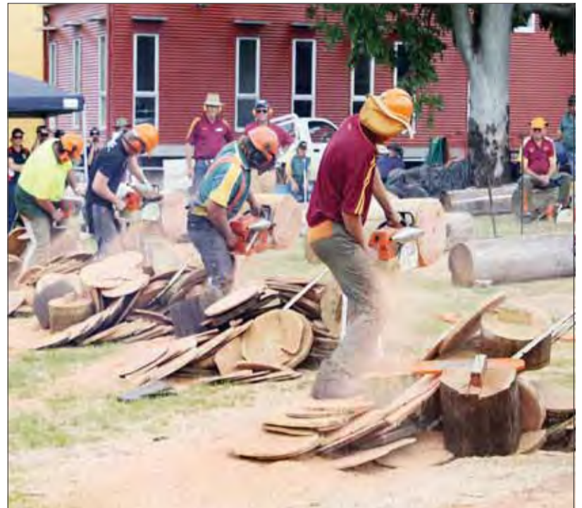
Chainsaw races organised by the Anduramba Chainsaw Club on Crow's Nest Day in the grounds of the Grand Old Crow Hotel.