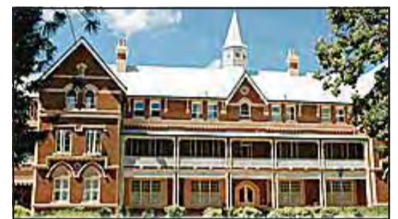
Toowoomba Grammar School

"The boys at Toowoomba Grammar School have a very active existence through the provision of sporting programs such as swimming, cross country