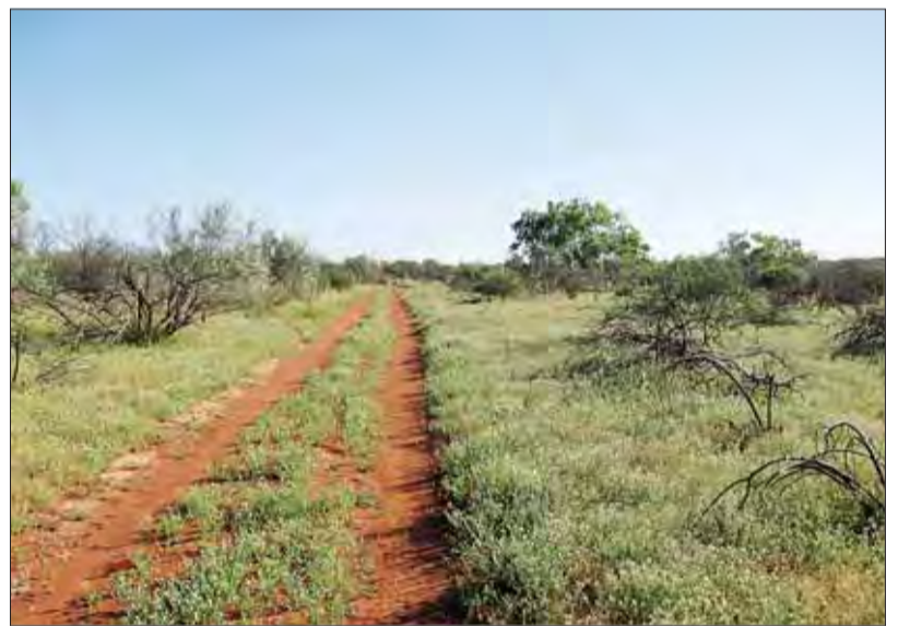
Dampier landscape - Western Australia

Whew! after travelling for so long with few people, it is a shock to arrive at Port Hedland. Salt pans stretch far away from it, iron ore trucks with their four enormous trailers, fuel trucks with three trailers, salt trucks with two trailers and ordinary road trains, it is all a bit overwhelming.